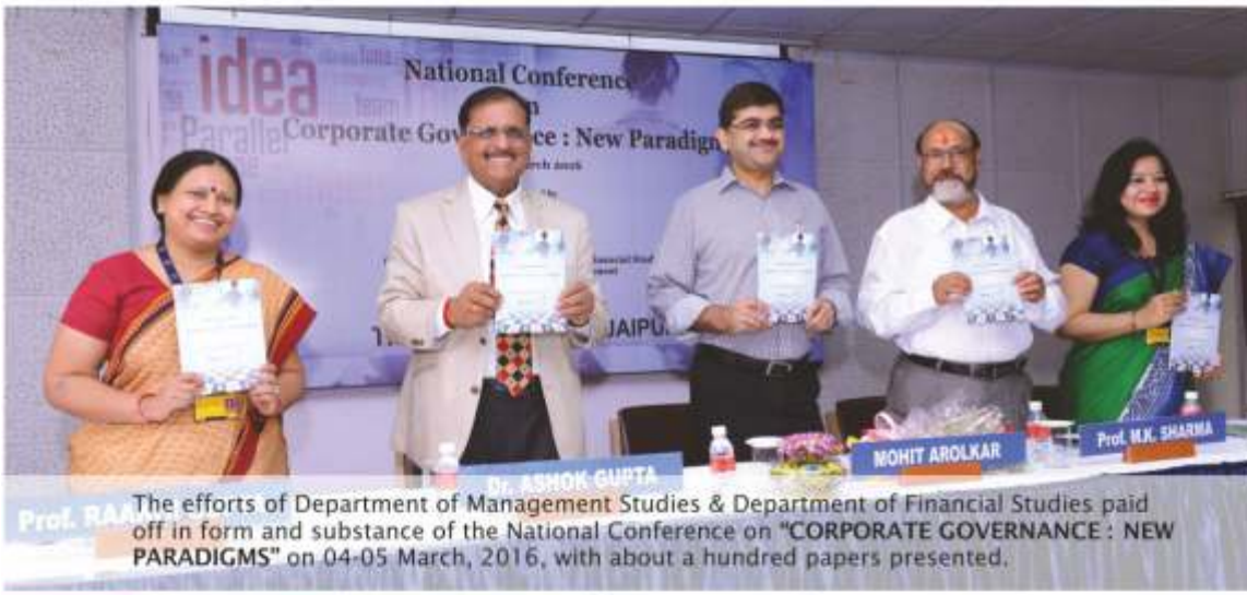
The efforts of Department of Management Studies & Department of Financial Studies paid off in form and substance of the National Conference on "CORPORATE GOVERNANCE : NEW PARADIGMS" on 04-05 March, 2016, with about a hundred papers presented.