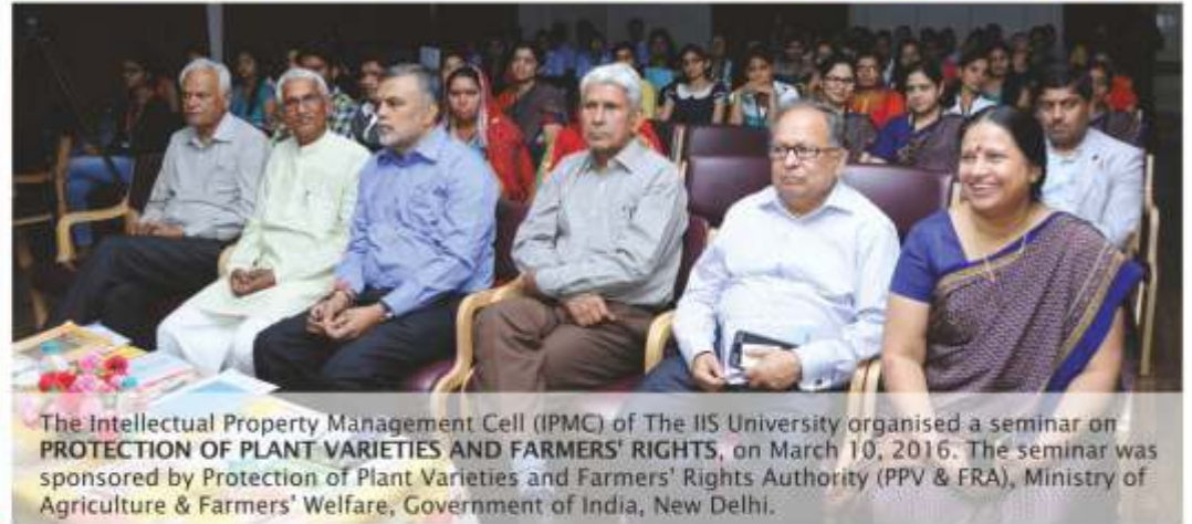
The Intellectual Property Management Cell (IPMC) of The IIS University organised a seminar on PROTECTION OF PLANT VARIETIES AND FARMERS' RIGHTS, on March 10, 2016. The seminar was sponsored by Protection of Plant Varieties and Farmers' Rights Authority (PPV & FRA), Ministry of Agriculture & Farmers' Welfare, Government of India, New Delhi.