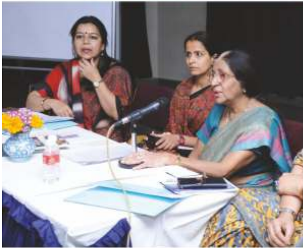
Bachelor in Journalism and Mass Communication, added a practical aspect to the curriculum with a launch of an in-house news channel, screening the hustle-bustle in the university.